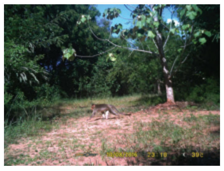
oration in a succession