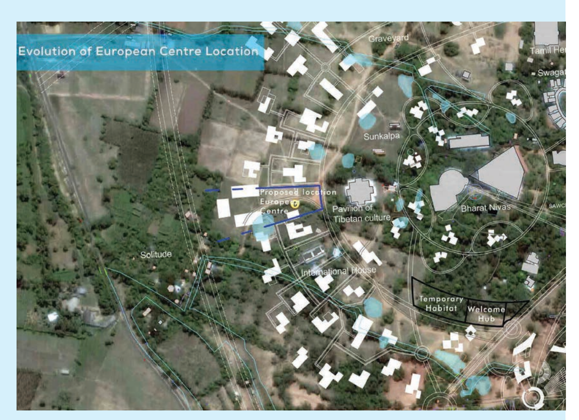
International Zone - European Centre Location

Multi-Purpose Hall for rotating exhibitions, an Internet Café, an international restaurant/food Court, as well as space for offices, storage, and staff amenities for living accommodation on site, but as this project is subject to continuing study and evolution detailed requirements are likely to change.