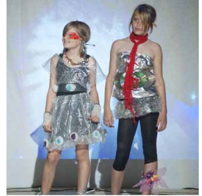
"Trashion Show" models

Come evening and everybody flooded down to the Visitors Centre. There was a buffet and all the Auroville bands were going to play, but the really big attraction was the 'Trashion Show' where 27 Aurovilian designers, amateur and professional, were to show their latest fashion creations made only of trash and un-recyclable materials. Beautiful young people sashayed down the catwalk tastefully adorned with CDs, cement sacks, bubble wrap and coffee powder wrappers. Accessories included Tetra Pak boots and woven cassette-tape handbags. It all looked great. There was even a