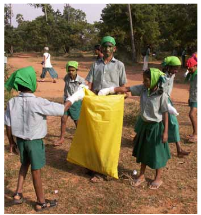
Aikiyam School children picking up litter in the green belt

e'd been warned! For weeks posters and t-shirts had been appearing around Auroville preparing us for the big event – Litter-Free Auroville (LFA) 2010. The big day, Friday, 29th January, arrived.