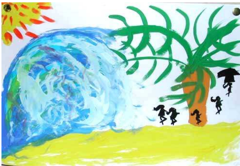
Painting of the Tsunami by child from Transition School

Approximately 55 people, both volunteers and salaried, are directly involved in our activities. These include a dedicated group of rehabilitation workers, program and project coordinators, trainers, teachers, product designers, researchers, forest specialists, accountants and administrators. As more projects are being started, more people will be needed to make effective implementation possible.