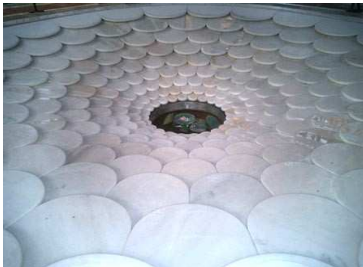
Lotus pond below Matrimandir

The last two months have seen a lot of activity along the radial paths dividing the twelve garden areas. Teams are working to establish the concrete gutters which will serve as drains to channel heavy rainfall away from the Matrimandir. This will also protect the white marble lotus pond beneath so that it does not get flooded during the monsoon! These drains at the edge of each pathway slope down 30cm. as they reach the Oval road encircling the gardens, thus