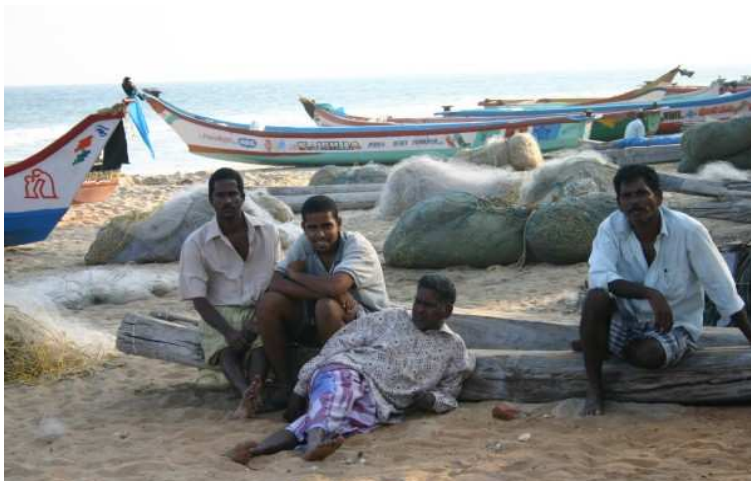
Fishermen from a village affected by the tsunami.

Within two years a total of 100,000 trees will be planted along the coast in six villages. Three forest-dedicated Auroville nurseries are busy with taking care of the seedlings. This year approx. 15,000 seedlings will be planted, next year the remaining 85,000.