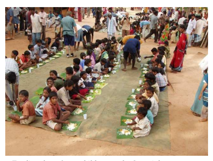
Feeding the refugee children on the first night

Within an hour of the tsunami striking the coast, a group