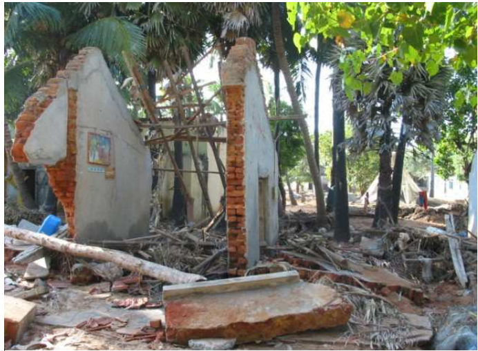
Devastation in the fishing villages

of Aurovilians came together to organize emergency aid. A tent-village was set up near New Creation to provide shelter, blankets, buckets, clothing and food to the displaced villagers, who soon numbered over 1,000. A relief centre was created in a Night School in Kottakarai to care for another 200 villagers.