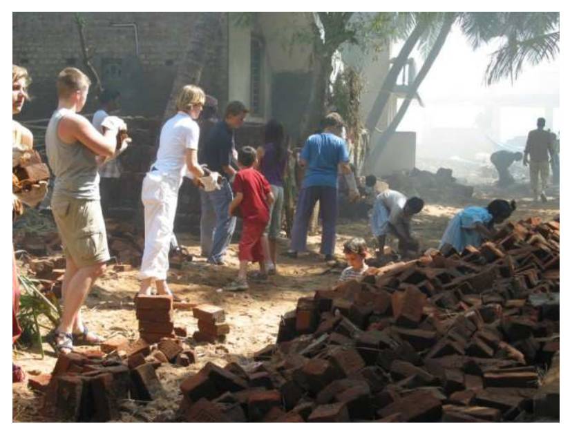
Clean-up operations in a fishing village.

There are now various projects aiming at rehabilitation