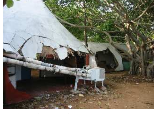
A shattered Auroville house in Sri Ma

enough from the sea for us to be oblivious of the unfolding events. We had just purchased satellite radio. somehow we had not taken the trouble to turn on that For lunch, we morning. decided to visit Ganesh Bakery, which serves simple lunches and excellent bread. It was only then that we heard of the floods along the beach, and the exodus of local villagers from the beach area. No one seemed to have heard the cause of the floods, nor the extent of the damage.