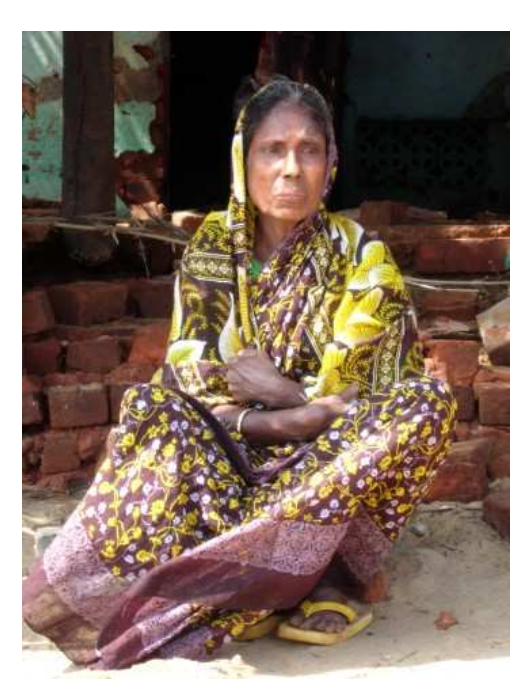
Many villagers were severely traumatised

of the affected villagers. The Rehabilitation Programme consists of four distinct but very much interlinked projects: