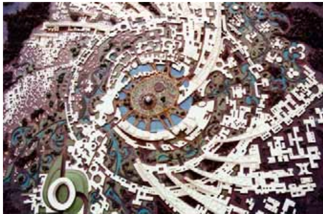
The Galaxy Model

implementing the city. My concern was that with so much emphasis on building the galaxy plan as a fixed architectural and essentially sculptural concept, a true participation process would be sacrificed. To implement the city is to find an integral process, which does not pay lip service to participation whilst in actual fact, largely ignoring all those troublesome early pioneers and settlers, all those dreamers and visionaries. To implement an Auroville that can truly be an example to the world means also to be prepared to be flexible and holistic, taking into account ground realities, actual physical conditions, local social and larger current global concerns. I had the impression when with AVI, we met l'Avenir d'Auroville and others involved with the process, that the talk of participation was something of a PR exercise, and that there existed the danger that those tasked with implementing the galaxy plan had to some extent made a religion out of it, something so profoundly sacred that it could not be challenged.