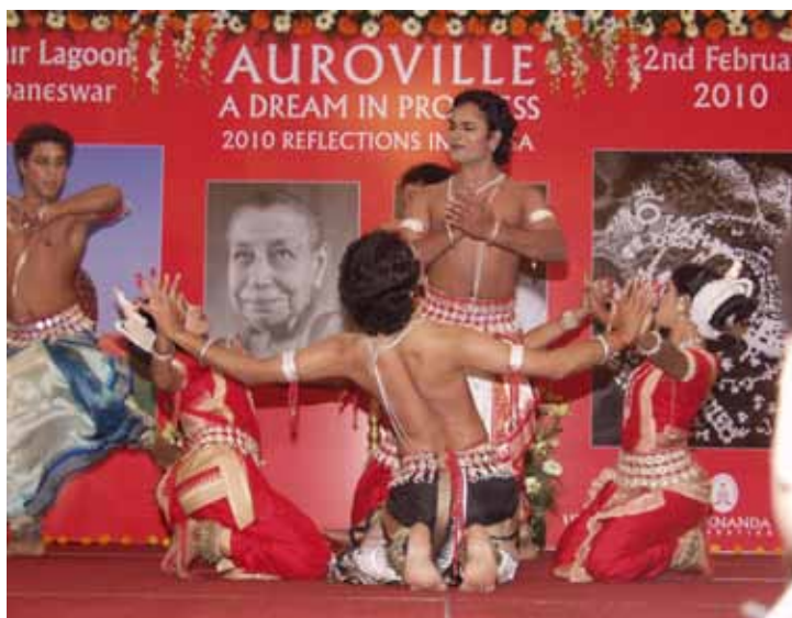
Odissi dance performance at the Auroville presentation in Bhubaneswar