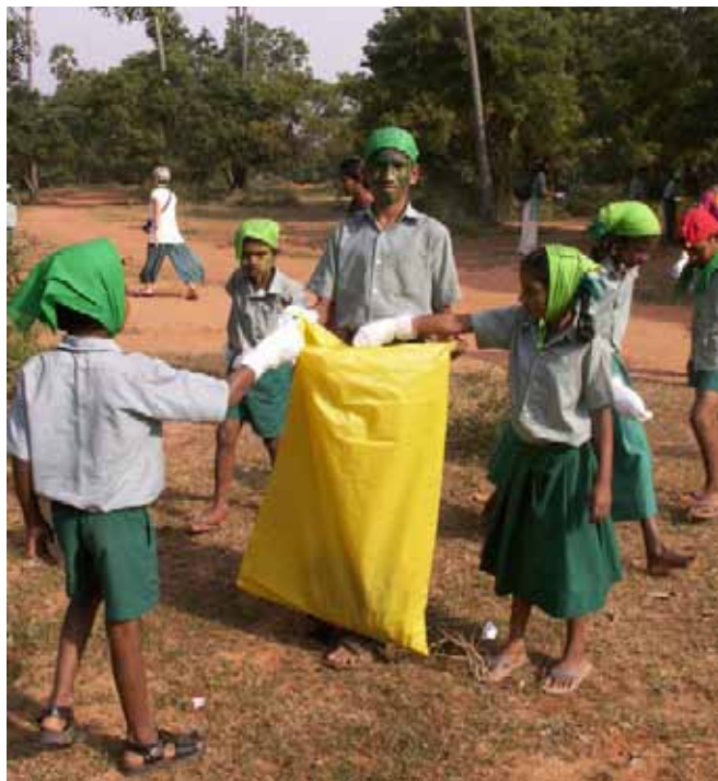
Aikiyam School children picking up litter in the green belt

We'd been warned! For weeks posters and t-shirts had been appearing around Auroville preparing us for the big event – Litter-Free Auroville (LFA) 2010. The big day, Friday, 29th January, arrived.