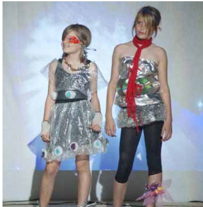
"Trashion Show" models

Come evening and everybody flooded down to the Visitors Centre. There was a buffet and all the Auroville bands were going to play, but the really big attraction was the 'Trashion Show' where 27 Aurovilian designers, amateur and professional, were to show their latest fashion creations made only of trash and un-recyclable materials. Beautiful young people sashayed down the catwalk tastefully adorned with CDs, cement sacks, bubble wrap and coffee powder wrappers. Accessories included Tetra Pak boots and woven cassette-tape handbags. It all looked great. There was even a