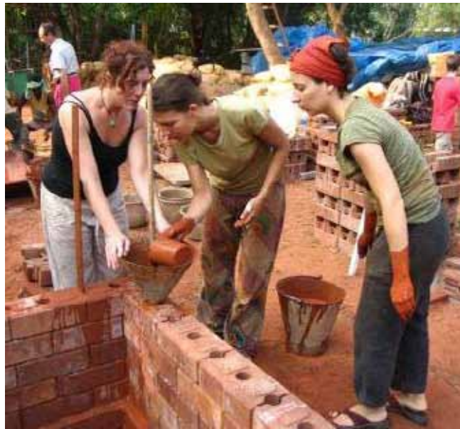
Volunteers building house in Realization

All materials were transported to the site in 3 days and the house was assembled in about 64 hours by a daily team of 16 paid workers and 10 to 15 volunteers. This house has been conceived as moveable and no cement mortar or cement concrete has been used to assemble the house. Only earth mortars and earth concretes were used to bind the compressed stabilised earth blocks.