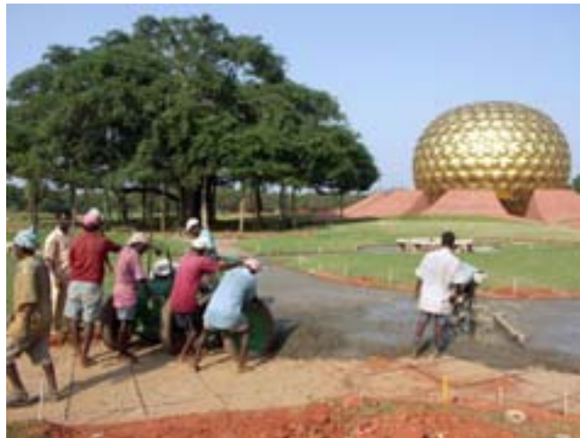
Concreting in Unity garden near the Banyan tree

There are three mirrors on top of Matrimandir. The first is the heliostat, a movable one, which rotates to catch a ray of sunlight. This ray is then reflected through a window to a second mirror, which is fixed, and which reflects the ray horizontally over to the third mirror positioned exactly above the crystal globe at the centre of the Chamber floor. This third mirror reflects the ray down to the globe, some fifteen meters below.