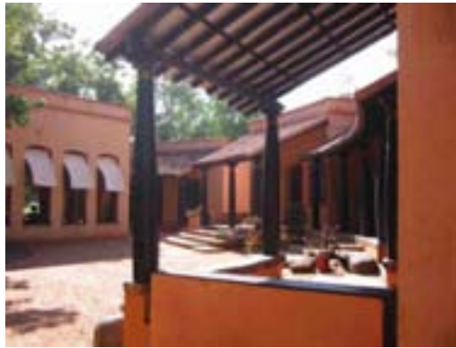
Atithi Grihar Guest House