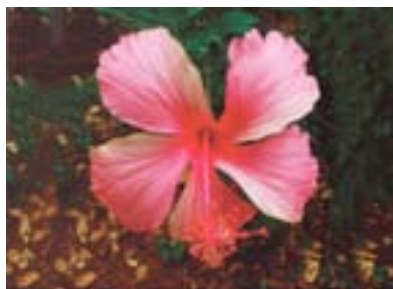
Existence: Pink Hibiscus Psychic Power In Existence.