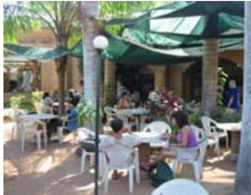
Visitor's Centre Cafeteria