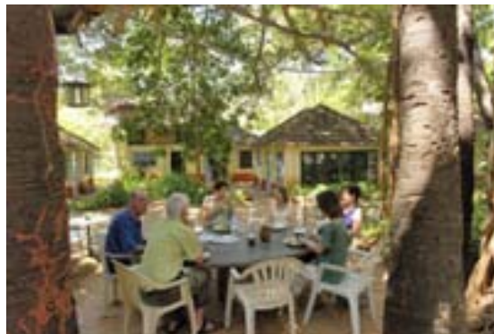
Centre Guest House