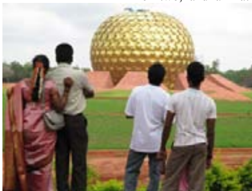
Visitors at the Matrimandir viewing point

Today, those who stay in Auroville guest-houses do not complain about not having enough to do. This past season has seen a record number of courses, workshops and therapies offered, on topics like healing, kung fu shaolin, laughter yoga and belly dancing, as well as introduction programmes to Auroville, the integral yoga, and the surrounding villages. And all at rates far cheaper than in the West or elsewhere in India. Then there are the high-quality cultural events, the restaurants and shops, the international ambience, and, of course, the completed Matrimandir. So it's not surprising that the Auroville guest-houses, with their