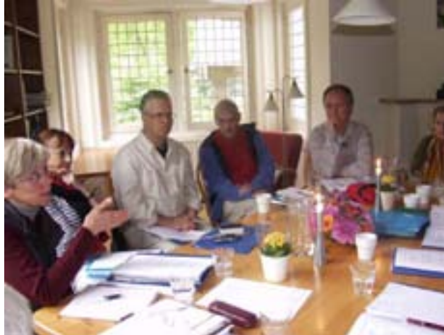
AVI Board meeting in Holland

The second is that all AVI Centres investigate the possibilities of helping to complete the Unity Pavilion complex, which is central to the development of the International Zone. This complex provides a space in the International Zone which everybody can use until their own National Pavilions are in place. The Unity Pavilion will also have the Hall of Peace where the Peace Table of Asia will be housed. For completing the Unity Pavilion complex, Rs 60 Lakhs (£80,000) is required.