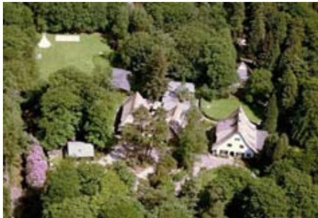
Conference Centre Venwoude, The Netherlands

The first is to start study groups – or strengthen the groups if they already exist – to study the fundamental genius of the