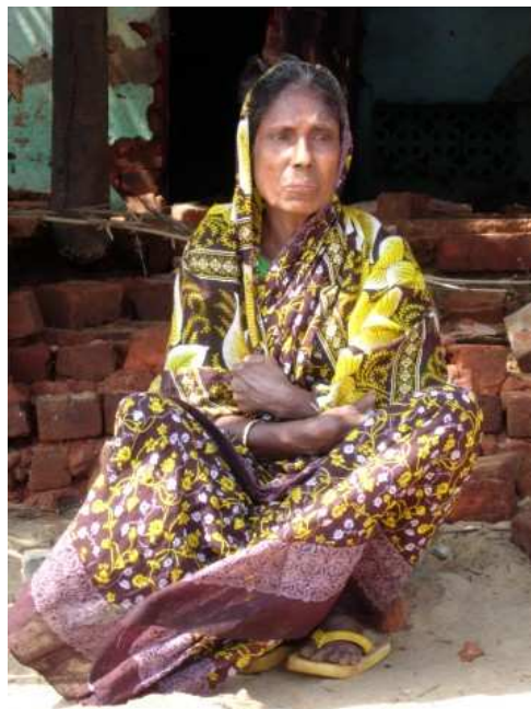
Many villagers were severely traumatised

There are now various projects aiming at rehabilitation