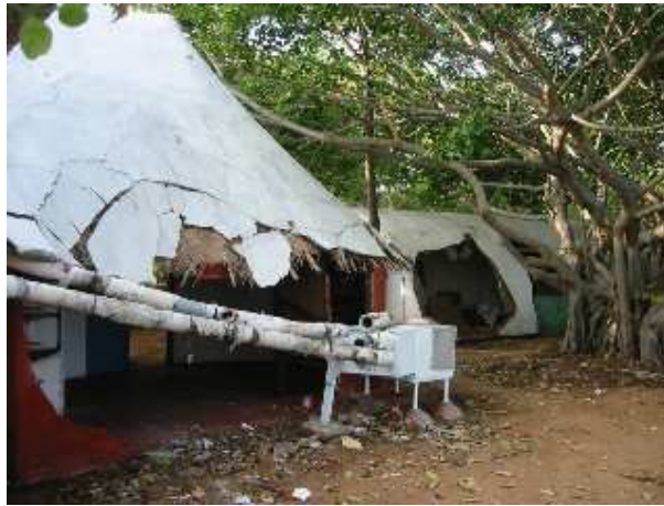
A shattered Auroville house in Sri Ma

On 26 th December, the whole world was shaken by the disaster which hit South East Asia. The television news coverage was dramatic and relentless, with hourly updates bringing news of the increasing death toll. My wife and I were in Auroville on the 26 th , we were visiting family and friends, and working with the various projects which AVI UK sponsors there. The morning of 26 th December was like any other. We have no television at our place in the greenbelt, which was far enough from the sea for us to be oblivious of the unfolding events. We had just purchased a satellite radio, which somehow we had not taken the trouble to turn on that morning. For lunch, we decided to visit Ganesh Bakery, which serves simple lunches and excellent bread. It was only then that we heard of the floods along the beach, and the exodus of local villagers from the beach area. No one seemed to have heard the cause of the floods, nor the extent of the damage.