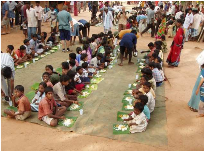
Feeding the refugee children on the first night

Within an hour of the tsunami striking the coast, a group