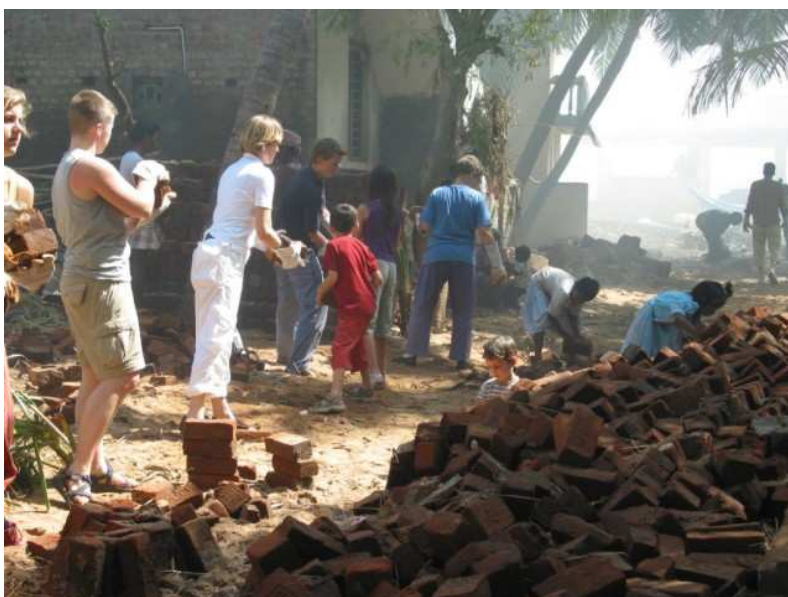
Clean-up operations in a fishing village.

In order to ensure the input of the affected villagers and to guarantee a need-based approach for all Auroville's activities, a Paalam (Tamil for 'Bridge') structure has been set up, in which each village or community is represented by one Panchayat member, one woman, one youth, and possibly one teacher. The Paalams meet every week and form an indispensable source of reflection and information on all projects.