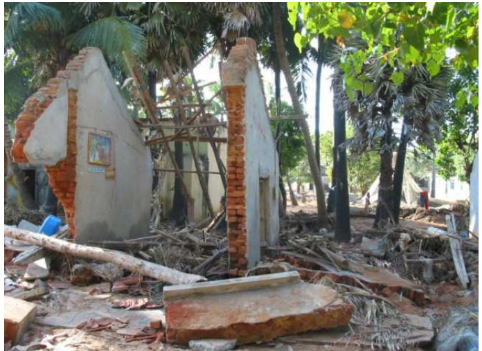
Devastation in the fishing villages

of Aurovilians came together to organize emergency aid. A tent-village was set up near New Creation to provide shelter, blankets, buckets, clothing and food to the displaced villagers, who soon numbered over 1,000. A relief centre was created in a Night School in Kottakarai to care for another 200 villagers.