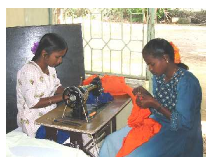
Girls at Life Education Centre learn vocational skills.

all those involved. Working with this project has been a true celebration of common purpose as we share a dream and an intention to serve our children through helping them to grow and develop with joy and self-confidence.