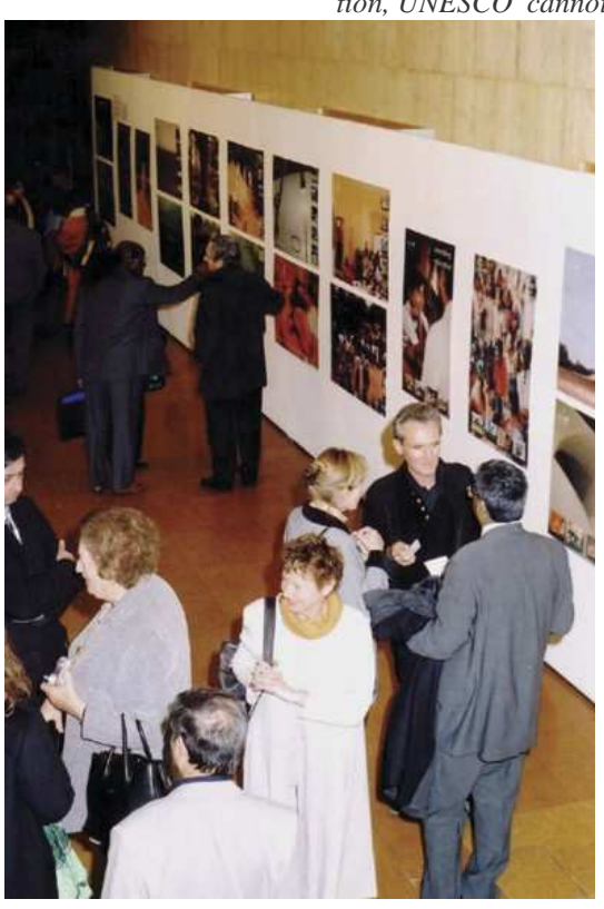
The Auroville Exhibition at the UNESCO headquarters in Paris

parallel in his speech between those aims and the three principles of the French revolution, liberty, equality and fraternity. He ended by pointing out that 'fraternity' - the key to the union of the three principles - had yet to be